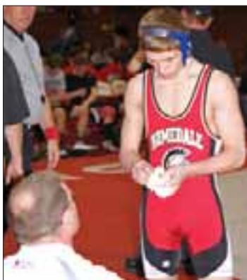
Trojan pins crown

Homedale set the table for an interesting 3A Snake River Valley conference dual-meet season finale this week by garnering as many points (52) as Weiser to finish knotted for ninth. The Wolverines visit the Trojans at 5 p.m. Thursday in the final action for Homedale before playing host to the 3A District III Tournament on Feb. 21.